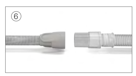
Connect the free end of the air tubing firmly onto the assembled mask. Press Start/Stop to begin therapy.